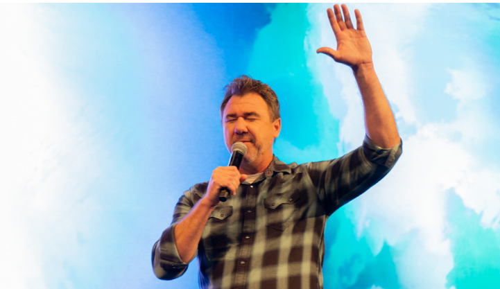
Purchased, renovated, and opened LifeChurch Carson