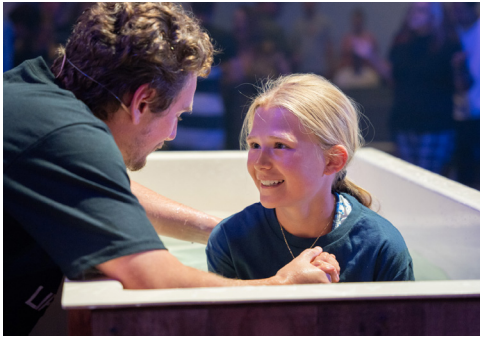
152 BAPTISMS the most ever!