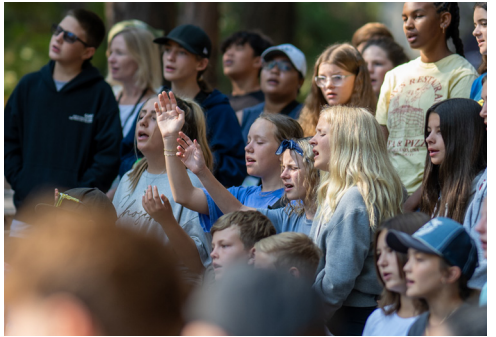
150 STUDENTS Middle School & High School Camp