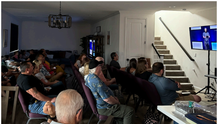
Sparks Campus Launch Team was formed