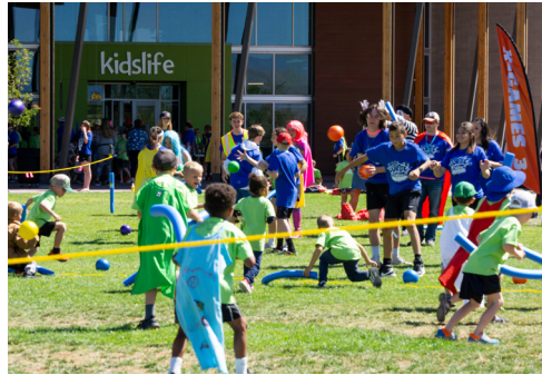
500 ATTENDEES Surge Camp